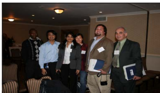
JPHCOPH students and faculty enjoy the BASS 15 Keynote presentation