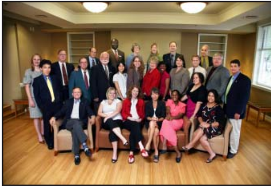
The photo above shows the faculty of the Jiann-Ping Hsu College of Public Health as they gathered for a group portrait on Convocation Day

On August 13th, the Jiann-Ping Hsu College of Public Health held Convocation. Though it was held in the Hollis Building, the meeting represented a milestone for our College in that it marked the beginning of the first full Academic Year (AY) in our new home, Cone Hall. The reconstruction, classified as an “historic renovation and rehabilitation” of the building, was a joint venture between Christman Constructors, Inc. of Lansing, MI, and Garbutt Construction of Dublin, GA, at a cost of just under four million dollars (see pp. 6-7 for a closer look at photos taken during and after the renovation).