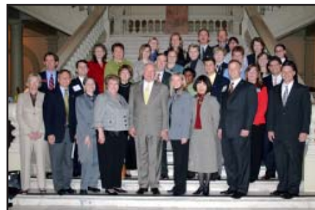
Governor Perdue and Rural Health Day Sponsors